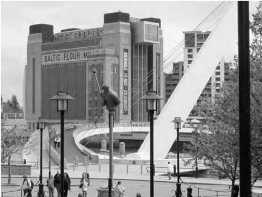
Figure 9.2 One of the main features of using reason is making connections: between premises and conclusions, between causes and consequences, between places (Millennium Bridge, Newcastle-Gateshead, UK).