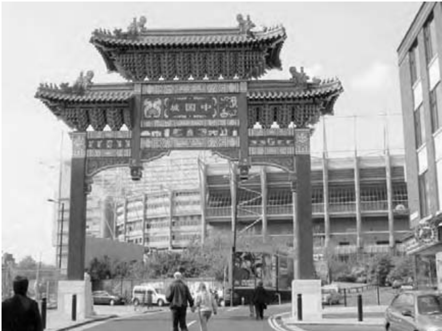
Figure 6.9 Many larger cities have Chinatowns, which have been enhanced by their residents and local authorities with gates, lanterns and signs (Newcastle, UK).

How do we design a multicultural city? It largely depends on how we envisage a multicultural city. Is it a city in which ethnic and cultural