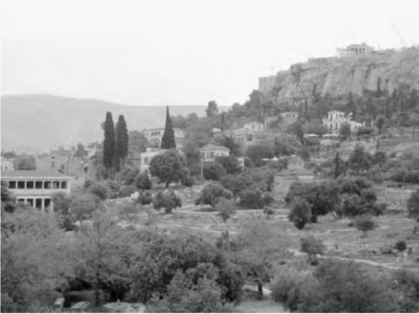
Figure 2.3 The Acropolis on the hilltop, the site of the city's prehistoric settlement, where the spirit of ancestors lingered (Athens, Greece).

queen of gods. At the same time, not all emotions were banned from the city, as exemplified by Bacchus, the god of wine and theatre. The city in the ancient world, therefore, was a place where the natural and the supernatural lived together side-by-side in a social world. Presence of the gods, and the places they inhabited, were determining factors in shaping the urban space. Urban form not only mirrored the everyday functions of the urban society, it also reflected their cosmology. The division of labour among the gods echoed the broad scheme of human concerns, as well as the social functions of everyday life. This was a higher order that not only shaped the city, it also ruled the entire world. It was a source of certainty and order, which was replicated in the geometry of the city.