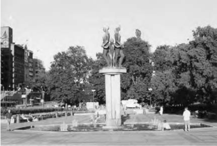
Figure 8.2 The human body has been used as a basis for measurement standards through the ages (Oslo, Norway).

finger of his extended arm. This distance, however, could shrink or stretch during commercial exchange and needed to be standardized. An exact yard was made and was kept in the Houses of Parliament in London for reference. As a result of a fire in 1834, in which Parliament buildings burnt down, the standard was damaged. Its replacement was a bar of bronze alloy, made and legalized in 1856. This was kept in the National Physical Laboratory, with four replicas in four different places as a precautionary measure. 19