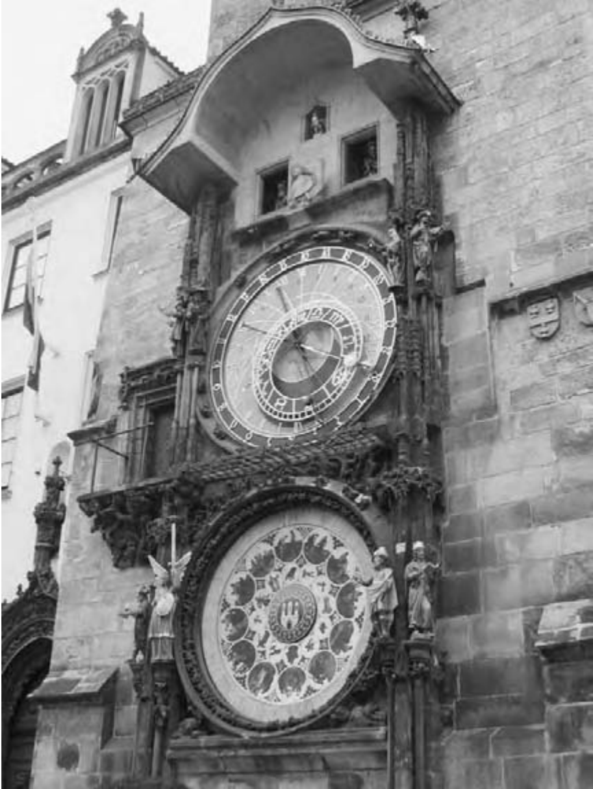
Figure 7.1 Measuring time is the ability to assign numerical value to what is after all not observable or the subject of direct experience (Prague, Czech Republic).