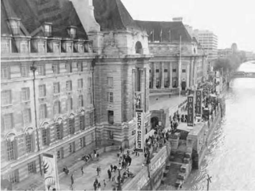
Figure 6.6 Fragmentation of the government has changed its role in urban development. After the abolition of the London government, its building has been used as a hotel, an aquarium, an exhibition hall and art gallery (London, UK).

rather than the symbolic or use value of their assets. 38 Local people, particularly the poor, on the other hand, are expected to be more involved in their own affairs, changing their role from consumers and recipients of services to participants in their provision. Meanwhile, the nature of expertise has changed, so that the experts are advisers, rather than the all-knowing professionals who knew what was good for people, as they once were thought to be. What emerges is a more complicated picture of power relations within a locality.