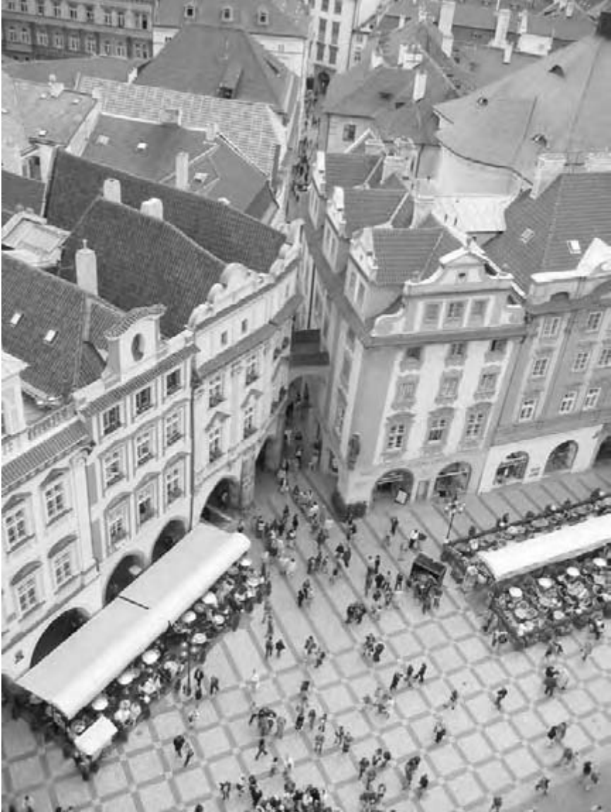
Figure 10.5 The medieval cities that lacked geometrical regularity were denounced by the modernists, who saw them as representing fragmentation and disorganization rather than connection and coherence (Prague, Czech Republic).