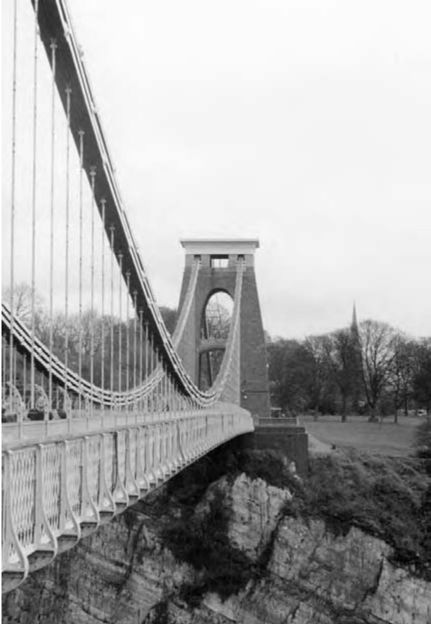
Figure 4.2 Wrought-iron suspension construction came to its culmination in Brunel's design for Clifton Bridge, which was eventually completed in 1864 (Bristol, UK).