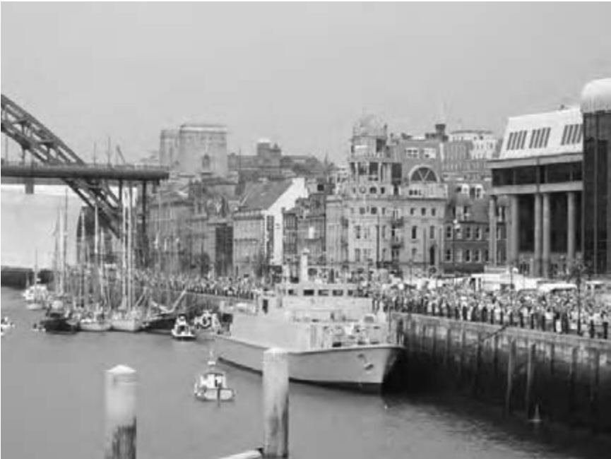
Figure 5.8 Would emphasis on natural elements, such as rivers and trees, or on colour and decoration, or on public events and festivals be a route to re-enchantment? (Newcastle, UK).

Much has been said about how rationality has disenchanting the world, emptying it of its spiritual and emotional contents. 86 So what would an enchanted city look like? Would emphasis on natural elements, such as rivers and trees, or on colour and decoration, or on public events and festivals be a route to re-enchantment? (Figure 5.8). The key problem is that after the dispersal of spirits and suppression of emotions, re-enchantment becomes an almost impossible task. Any new spiritual and emotional meaning would take a long time to root, while the speed of urban living has been faster than ever before. The result is partial, personal and