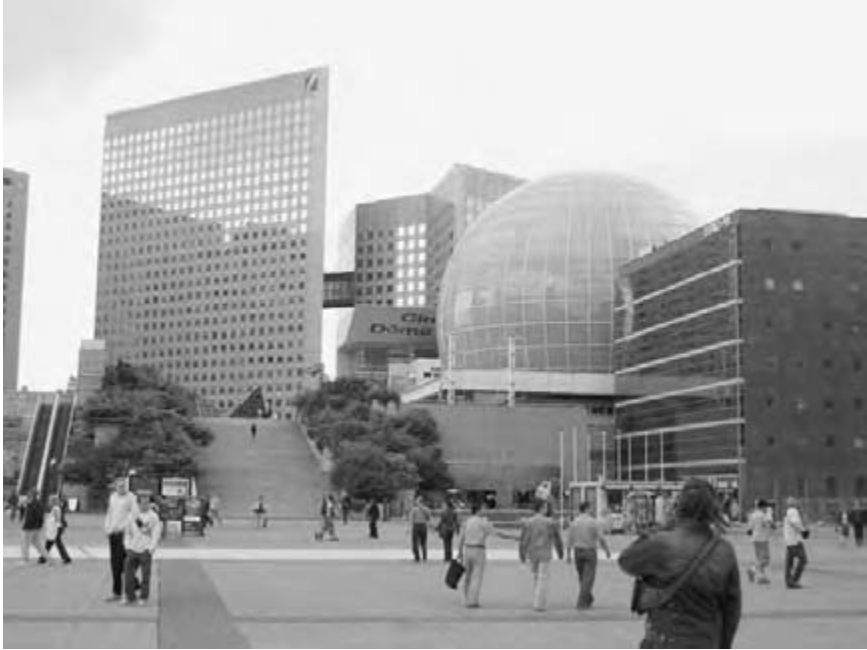
Figure 4.3 The aesthetics of modernist designers followed scientists and engineers, using primary forms of geometry (Paris, France).

otherwise there would be only chance, irregularity and capriciousness. 26 For him, therefore, ‘Geometry is the language of man.’ 27 It is ‘the means, created by ourselves, whereby we perceive the external world and express the world within us’. 28 Its use is a sign of civilization, as ‘Man walks in a straight line because he has a goal and knows where he is going’, whereas ‘The pack-donkey meanders along’. 29 The modern city, as exemplified by rectilinear American cities, which he admired, ‘lives by the straight line’, whereas the old cities of Europe represented the ways of the pack donkey. 30 Despite massive growth in their population and size, ‘the child-like configuration of their beginnings has persisted’. 31 While curved streets could be picturesque for pedestrians, straight roads were better for the fast movement of buses, trams and motor cars. 32 Cities were, therefore, in need of comprehensive redevelopment which would give them a new geometrical order fit for the age of industry and mobility.