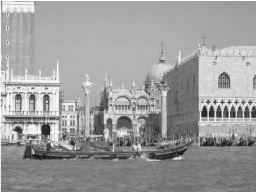
Figure 5.4 Ruskin found irregularity and colour in St Mark a delightful contrast with the Renaissance drive for harmony and proportion (Venice, Italy).

Ruskin had no regard for symmetry and proportion, which characterized Renaissance architecture, and was delighted to discover the irregularities in Venice's St Mark, as well as the rich colours of its façade (Figure 5.4). He found the Renaissance, in which he included baroque, soulless and cold, and associated its formalism with Catholicism, in contrast with the natural