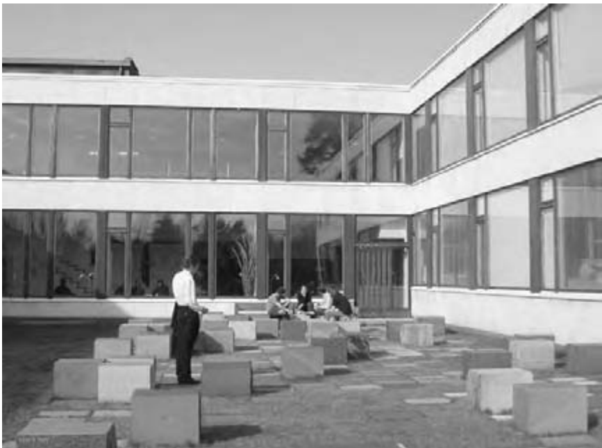
Figure 8.3 Thinking about space has led to new methods of thought (Helsinki, Finland).

The development of deductive reasoning and methods of analysis in philosophy and science are closely related to the development of thinking about space in geometry (Figure 8.3). The western science, Albert Einstein noted,