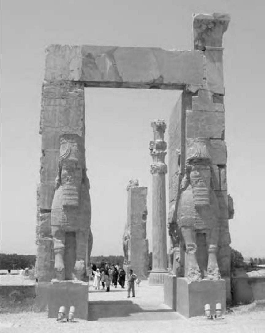
Figure 2.2 The ancient Persian city displayed a marriage of cosmology and temporal power (Persepolis, Iran).

By using the city walls to control the dangers of lust and violence, even within a mythological account of sites and functions, we see how city design was searching for an order and a way of justifying it, relying on the necessity of controlling and even excluding the emotions. Minerva, the goddess of wisdom, was located in the best place next to the king and