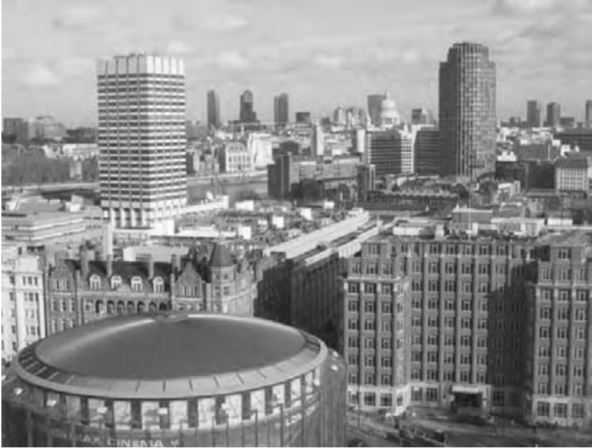
Figure 2.10 St Paul's Cathedral has to compete with other buildings for attention (London, UK).

Even in societies that consider religion a pivotal part of their life, temples, churches and mosques seem to have lost their old position in the life of the city, at least as far as their distribution in the city and their size and significance relative to other functions are concerned. As urban populations have grown, and movements and functions in cities have become ever more complex and diversified, new modes of working and living have emerged. While religious beliefs and practices may rule social norms and public conduct, they do not determine the built form or the spatial structure of the city. As cities have grown, the new urban areas and suburbs have hardly caught up in their numbers of houses of worship with the older central parts. The phenomenal growth of urban areas in the twentieth century has primarily been a secular one.