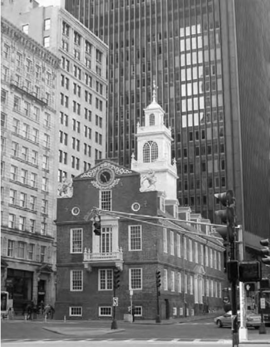
Figure 2.7 The Puritan city upon a hill became a modern secular city (Boston, USA).

spiritual worlds, and to create some forms of rational orders at the intersection of the two worlds, hoping that the spiritual would guide the temporal. This was taming the spontaneous and the everyday life by the orderly and unchangeable logic of a supreme reason.