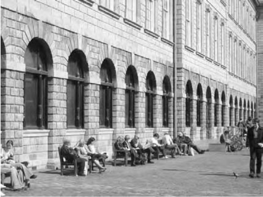
Figure 7.8 Old buildings and places can accommodate new life and technological innovation, without generating a feeling of unease (Trinity College, Dublin, Ireland).

around it. This is perhaps best captured in the metaphors and images associated with time; for example in the way time is said to flow, to be spent, wasted, killed, kept or lost. Whereas this perspective may be found in humanities, the scientists tend to think that there is already an order in the nature, which we seek to discover. 99