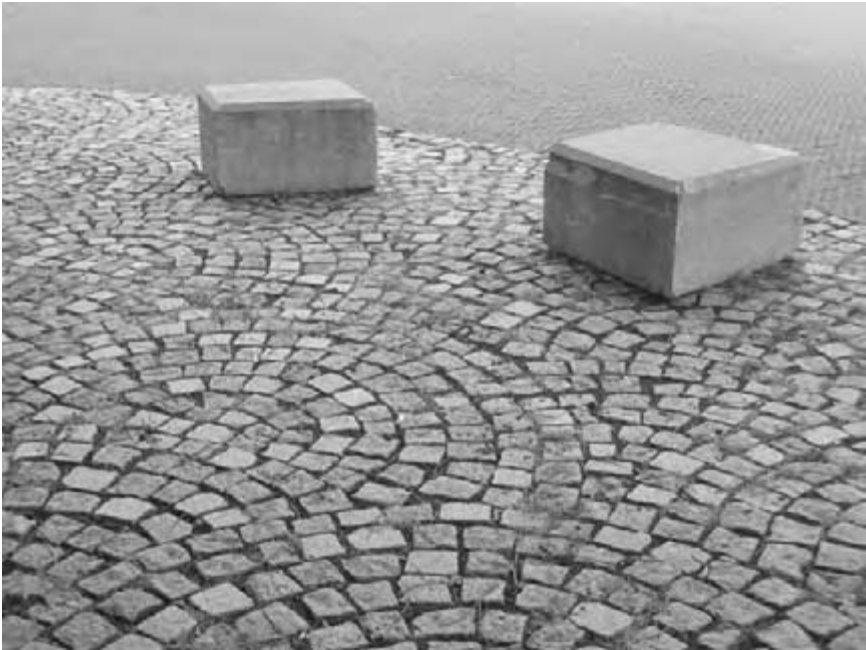
Figure 8.4 A key debate about space is whether it exists as an independent substance or it is merely a set of relationships; in other words whether it is real or imagined (The Hague, The Netherlands).

The debate between absolute and relational space mirrors a similar and related debate about time, as we saw in Chapter 7. The post-medieval reliance on rational sciences coincided with a rediscovery of Euclidean space and a belief in a metaphysical notion of absolute space. The invention of mechanical clocks had a profound impact on the notions of time and space. 44 Johannes Kepler wrote in 1605, ‘My aim is to show that the fabric of the heavens ( coelestis machina ) is to be likened not to a divine animal but rather to a clock’, and he taught how to explain its working ‘under the rule of numbers and geometry’. 45 For Kepler, ‘God always geometrizes’, as geometry is the basis of creation, using characters such as ‘triangles, squares, circles, spheres, cones, pyramids’ to write nature’s book. 46