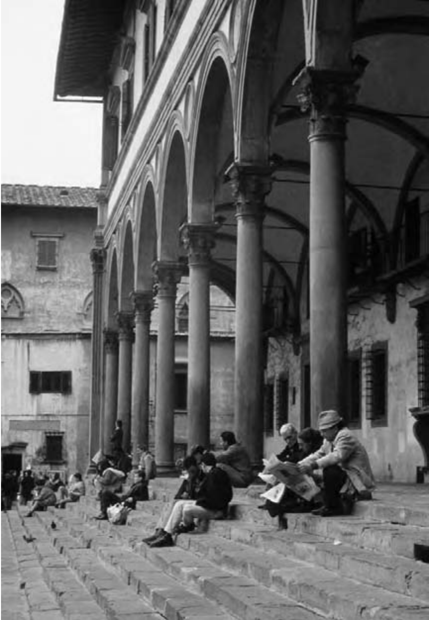
Figure 3.4 Piazza Annunziata, in front of Brunelleschi's Foundling Hospital, shows the first signs of connected action through generations to create spatial harmony (Florence, Italy).