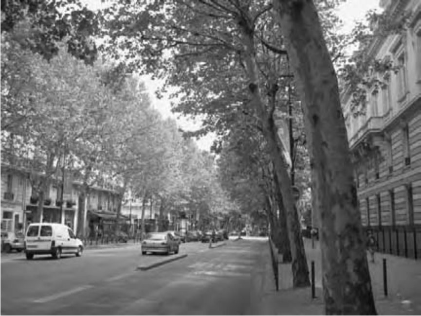
Figure 5.3 In an effort to integrate nature into the city, tree-lined boulevards transformed the city's atmosphere (Paris, France).

Here, however, the old Renaissance ideals of axes and networks and adaptation to the rules of perspective remained at the core of the project. In the laissez-faire conditions of British cities the freedom of architectural expression of the rising businessmen, who no longer shared the coherent taste of the aristocratic elite, caused a diversity of styles. The Parisian transformation maintained a firm grip on the shape of the city, establishing a new spatial order onto a rebellious city. Freedom, however, was available in using the new spaces as sites of pleasure and spectacle for Parisians and visitors from around the world. The English cities were under other forms of control, which reduced this element of pleasure. One of the main differences between the urban parks in England and France was the presence of restaurants and cafés in Paris parks, where refreshment and entertainment were integral parts of Haussmann's programme, whereas in England the nonconformist and evangelical lobbies campaigned to ban drinking and betting from the new parks. The Bourse in Paris had the grandest exchange building in Europe, and the new parks, boulevards, arcades and galleries ensured the city's position as the European capital of leisure as well as business. 61