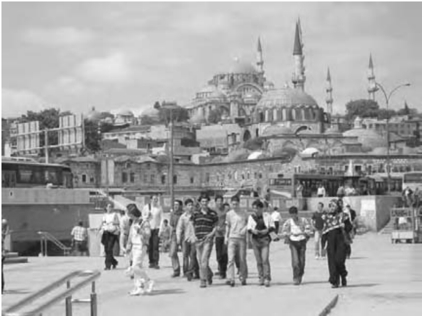
Figure 2.8 Religious beliefs and cosmological notions have shaped many cities through the ages (Istanbul, Turkey).

No matter how these systems of beliefs were arrived at, through reasoning or trusting in others, they could influence and shape action. Furthermore, building cities is a practical and social exercise, involving many actors involved in complex processes of organization and use of resources. Whatever the system of ideas that influence the shaping of the city, the way the city is built is often limited within the range of possibilities pro-