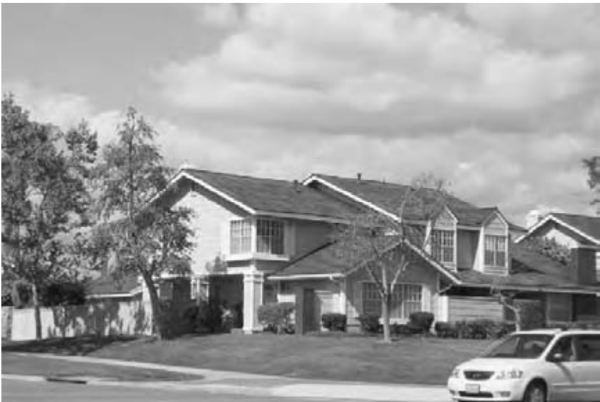
Figure 5.5 Escape from the city and mixing town and country have remained key themes of suburban development (Los Angeles, USA).

The dramatic expansion of suburbs was facilitated by improvements in the modes of transport, from horse-driven omnibuses of the 1820s to railway lines, horse and then electric trams. In the twentieth century, suburbanization became the main form of urban development in the English-speaking countries and a widespread model elsewhere. 68 Mixing the town and the country in the suburbs remained a target in building the cities to this day (Figure 5.5). By the end of the nineteenth century, the Garden City movement aimed at