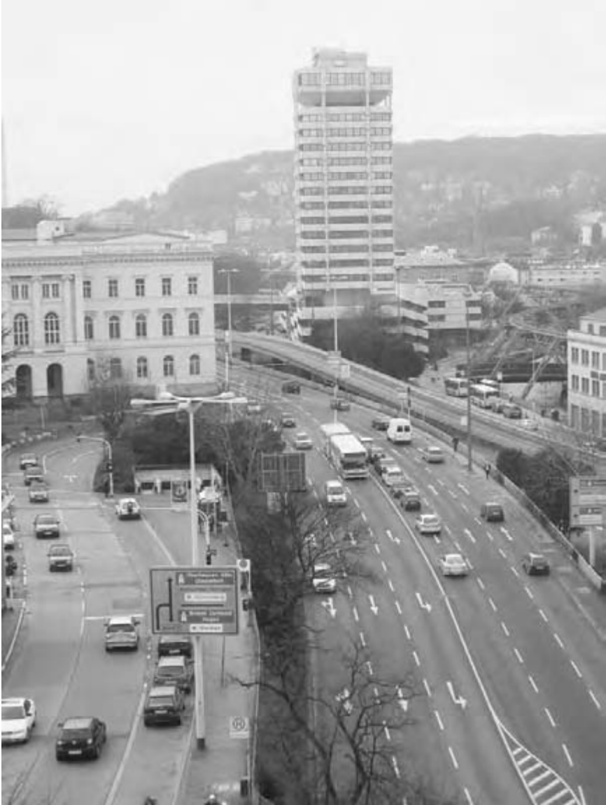
Figure 11.4 The desire for establishing connections at all costs has torn the fabric of cities apart (Wuppertal, Germany).