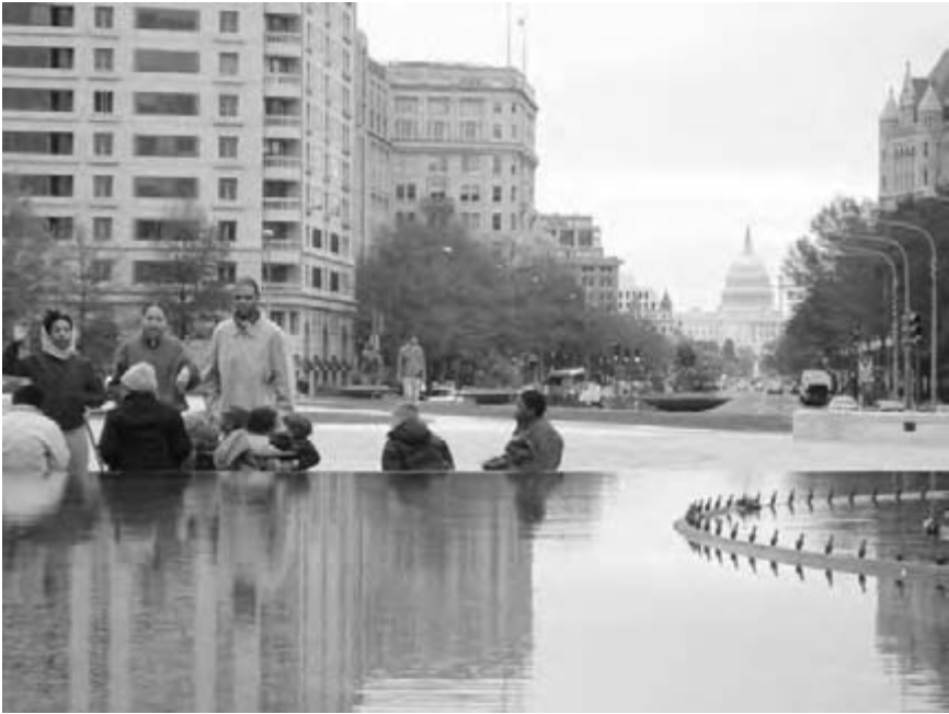
Figure 6.3 How could urban design and development respond to the needs of different income, age, gender, ethnicity, income and lifestyle groups? (Washington, DC, USA).

Society is stratified in many different ways, as it is formed of diverse individuals. Furthermore, at any one point in time, an individual may belong to a number of different groups. This leads to an enormous range of possibilities in classification. While the number of roles and groups are relatively limited in small towns and villages or in traditional societies, the large cities and modern societies are partly characterized by the complexity of their patterns of diversification. The way we become aware of these diversities, represent them to ourselves and others, and act upon them, depends on society's material and mental conditions. As economic, political and cultural features of a society change, the form of its actual stratification tends to change; while its collective consciousness changes, it becomes more aware of this stratification, represents it in new ways, acts upon it, or just suppresses it.