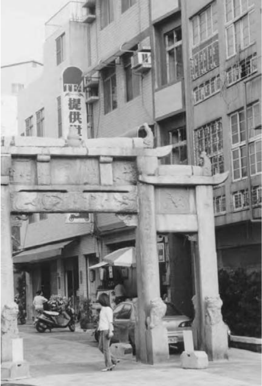
Figure 2.1 Temples, palaces and gates connected the material and spiritual worlds (Tainan, Taiwan).