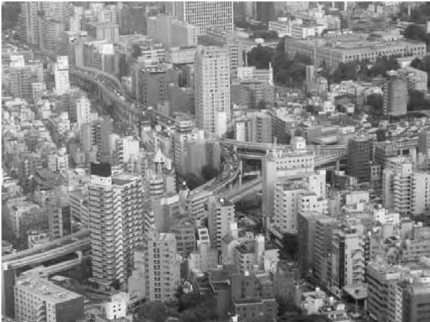
Figure 4.4 Separation of buildings from roads would abolish corridor streets and create multiple independent geometries (Tokyo, Japan).

The sense of order in the old geometry was achieved through the collective composition of mass and void, i.e. buildings in relationship with streets and other open spaces. Now this order was questioned by the modernists, who introduced the motor car to this composition, smashing it into pieces in order to let the car in. The Renaissance and Baroque notion of the city was based on streets and squares, which related buildings to one another and provided the public spaces of the city for movement and repose. The exterior of the building mattered as part of the street scene, needed for generating harmony with others around it along the axes and nodes of the city. The Corbusian city, however, was based on the primacy of buildings, believing that ‘the exterior is the result of an interior’. 35 This released buildings from being related to other buildings, and removed all the previous notions of harmony. Separation of buildings from roads