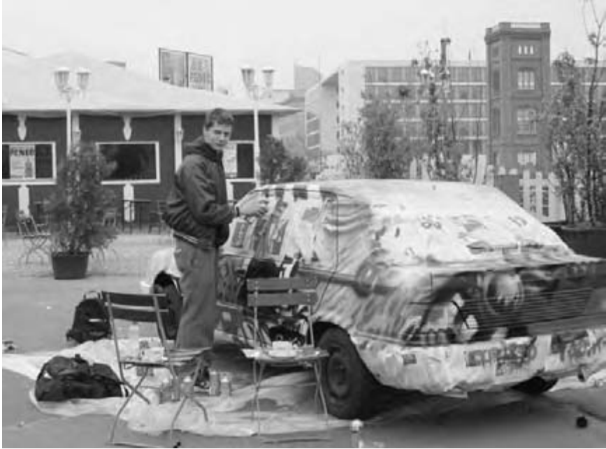
Figure 10.7 At the individual level, public infrastructures of meaning are challenged and transformed (Berlin, Germany).

multiplicity. In knowledge, this means abstractions that are applicable to different conditions. In communication, this means words and symbols that may mean the same thing in different contexts. In practice, this means tools and skills that are applicable to different needs. The reality is that collectively developed notions (words, symbols, skills) are applied by a particular individual or group of individuals in a particular context.