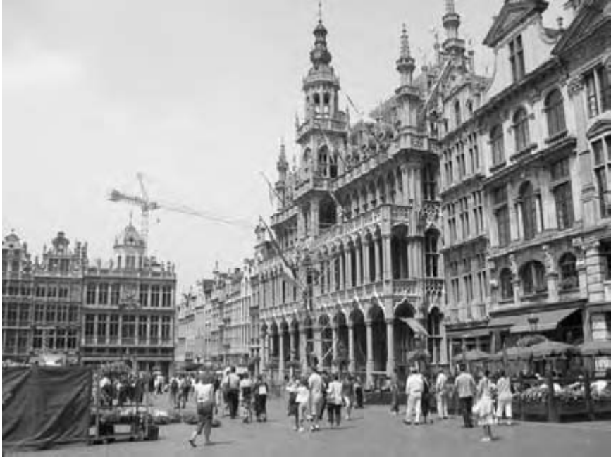
Figure 2.6 Medieval cities were places of trade, marketplaces at crossroads (Brussels, Belgium).

Focus on trade provided a basis for transition out of a religious and into a secular framework, which provided the groundwork for the emergence of Renaissance humanism. The walls that surrounded the city and the church that formed its spiritual (and at times temporal heart) were the common infrastructures of the medieval city. They contained and shaped the medieval society and were the point of reference for actions and beliefs of the city dwellers. The city wall was a manifestation of the temporal power, while the church represented the spiritual power. Together, they largely shaped the city, providing a common framework within which social life of the city was organized. Both these frameworks, however, were constantly tested by actions and beliefs that would not be constrained by them. The rise of faubourgs challenged the temporal power of the state, while the rise of humanist science did the same to church teachings. There was a constant tension between existing accounts that claimed validity and the competing accounts that were emerging. These were actions and beliefs that did not fit within the accounts that had a claim to truth and universality.