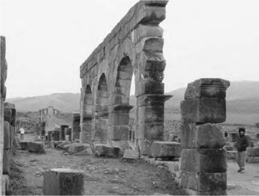
Figure 2.4 Complex rituals were involved in the planning and development of a new Roman town (Volubilis, Morocco).

emotion, knowledge and faith were intertwined to make sense, and give order to, the life of the city.