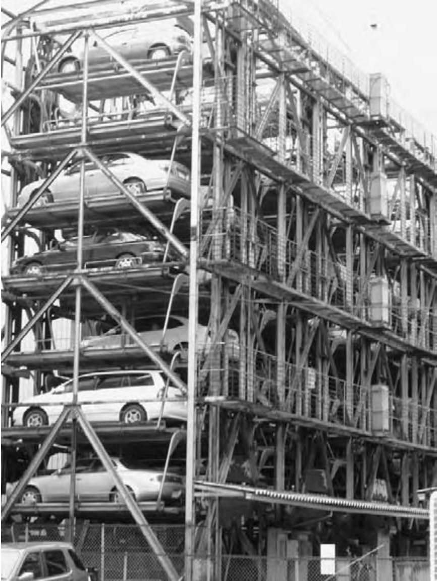
Figure 5.7 Reducing the impact of cars on urban space is one of the major challenges for the global environment (Sendai, Japan).