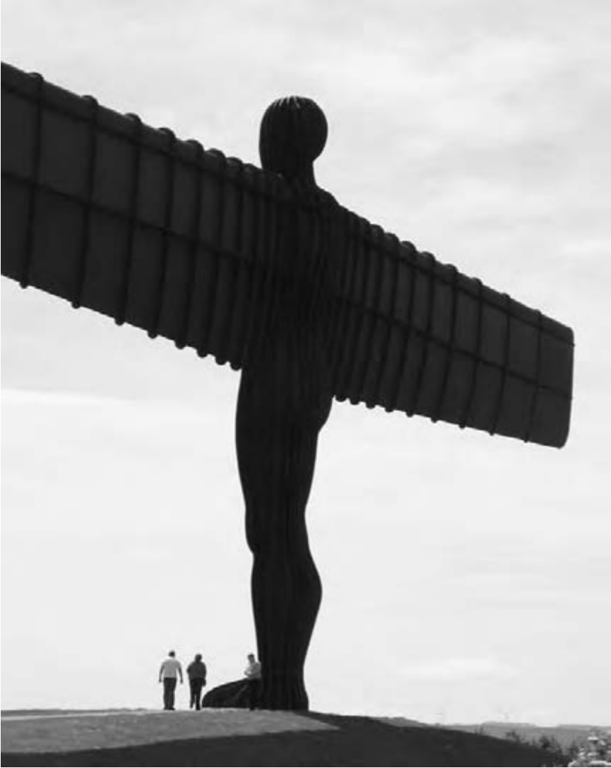
Figure 2.9 The centre of gravity has changed to humans, even if religious iconography is still employed (Gateshead, UK).

was necessary to rely on reason as an internal force. The medieval thinkers had seen rationality as conformity to the divine law. With the rise of humanism, human reason became the only reliable foundation upon which any laws could be understood and justified. The medieval thought, therefore, was not concerned with the opposition between reason and faith, as