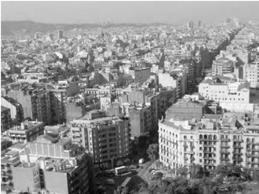
Figure 3.10 For centuries, gridiron networks have provided a structure for urban growth (Barcelona, Spain).

A similar pattern of a grid around a central square could also be found in English cities of the United States. Philadelphia, for example, was founded in 1682 by William Penn, who gave detailed instructions on the selection of the city's site and its layout. The backbone of the plan was a 100-foot-wide high street that stretched from one river bank to another, a broad street of the same width intersecting it at right angles in the middle of the city, where a central square was to be surrounded by major civic buildings. The rest of the town was shaped by a gridiron network of