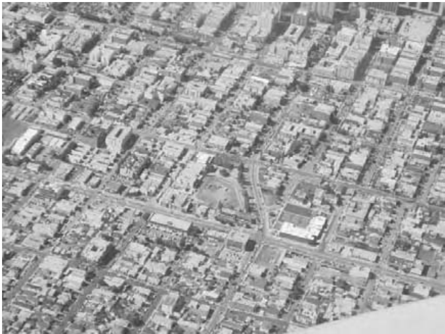
Figure 9.4 Can particular urban forms, such as grids, be neutral in value? (Los Angeles, USA).

This concern for value-neutrality in knowledge can also be observed in action. Are actions only representative of a person’s or a group’s interests, or can they be value-free, good for all? Can we plan and design cities, or any social framework for action, which is value-neutral? (Figure 9.4). Can