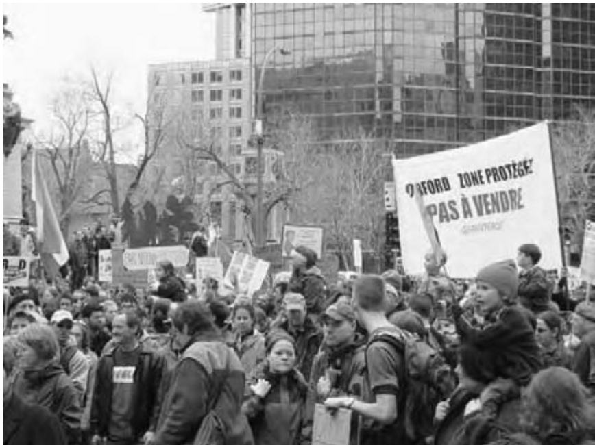
Figure 6.2 In the modern democratic societies, the source of power has shifted to a wider base, and now the city needed to be designed for people (Montreal, Canada).

Historically, cities were designed and developed in accordance with the representations of gods and kings as the sources of spiritual and temporal power. Major landmarks, nodes and axes were developed to enhance the position of these sources of power in the daily life of the citizens. As the modern democratic societies emerged, however, the source of power shifted to a wider base, and now the city needed to be designed for people (Figure 6.2). Rather than gods or kings, it was now the people who were