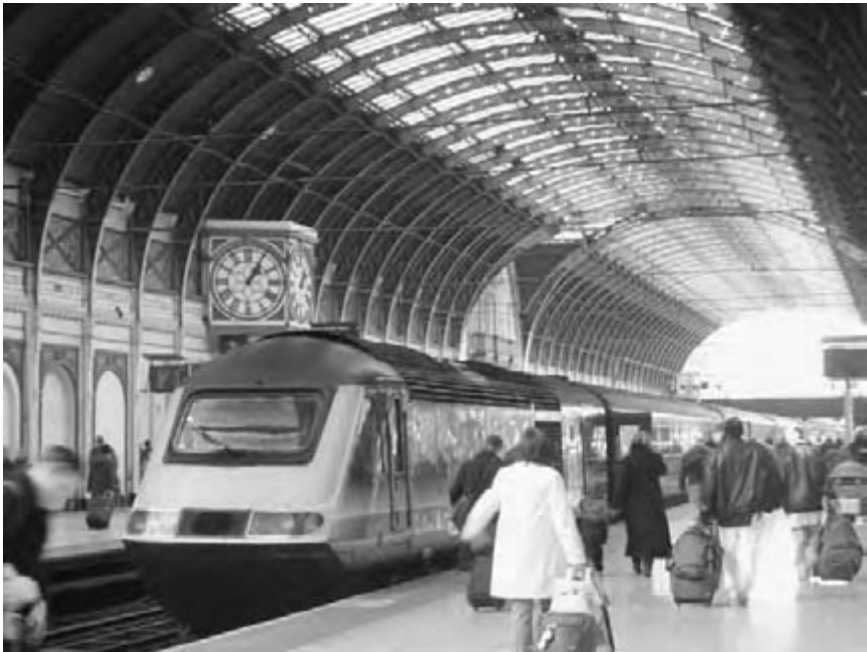
Figure 7.2 Introduction of trains in the nineteenth century revealed the differences between local times, which were replaced by a standard ‘railway time’, as displayed in Paddington Station (London, UK).

Yet another problem was to find a common framework between different towns within a country or between different countries of the world. By the nineteenth century, different towns in Britain had different local times; for example there was a difference of 20 minutes between London and Cornwall. With the introduction of (especially long-distance) trains, these differences were no longer tenable, as accuracy of train timetables would not be possible. A standard that was already being used for navigation, Greenwich Mean Time, was adopted for all local times in Britain, a time popularly known as ‘railway time’, legalized in 1880 by parliament (Figure 7.2). There were also differences between different countries (four minutes between France and Britain) and between different parts of large countries,