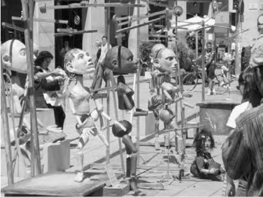
Figure 10.4 Expression and communication becomes a performance, where the non-verbal expression may be performed on its own, or be combined with verbal expression of uttering words and sentences (Barcelona, Spain).

the performer's acts and the audience's reception and reaction to them in these forms of direct or technologically-mediated communication. These distinctions also direct us to potential gaps in communication and understanding, where one side's intentions are not shared by the other side. To bridge any potential gap, we resort to social conventions, which are commonly understood and shared, even if differently interpreted. These conventions help create a public infrastructure of behavioural codes which individuals employ in the hope of linking the performer and the audience.