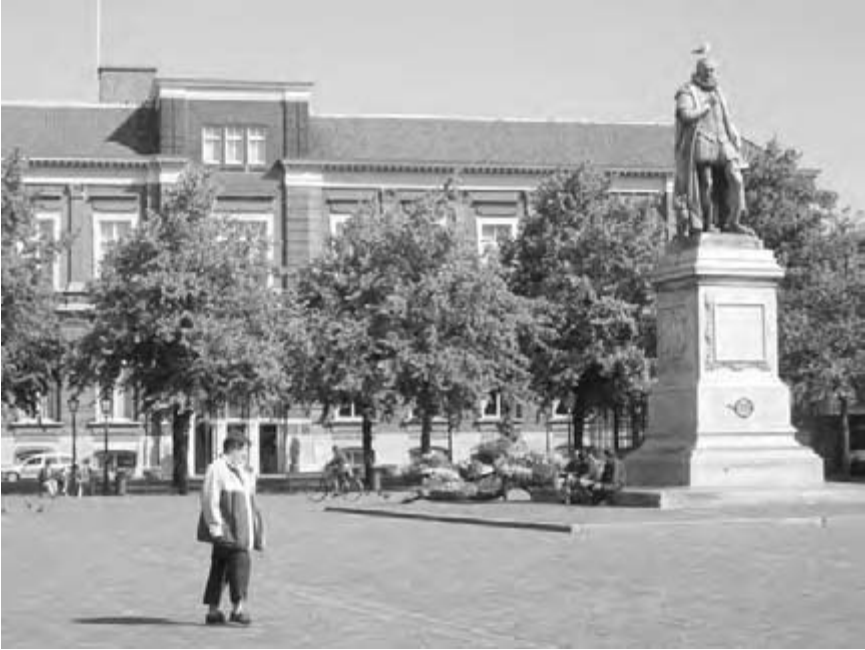
Figure 6.1 The notion of individual autonomy has been challenged to be mythological and in need of being placed within a social context (The Hague, The Netherlands).

a first-person perspective into the world, of the observer's own point of view for validating and confirming an objective foundation for experience and knowledge, has been a major driving force for European philosophy. 4 The notion of the autonomous self, however, started to be questioned from the nineteenth century under pressure from two critical evaluations, which showed the self to be closely tied to society and nature rather than standing outside them.