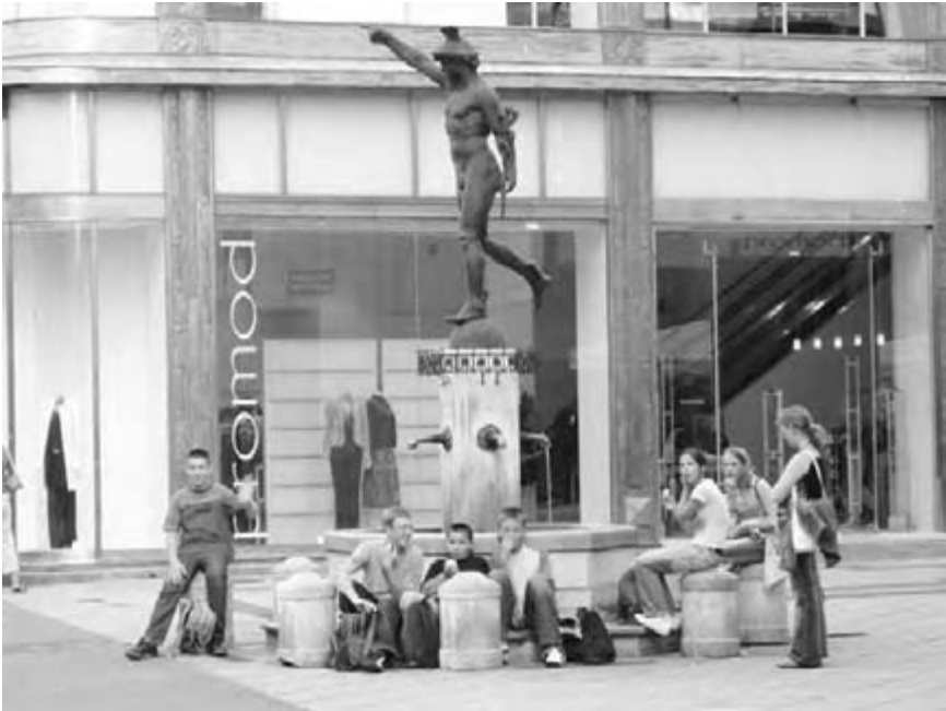
Figure 6.4 How can we design cities that cater for the needs of children as significant members of society? (Budapest, Hungary).

members of society, rather than unimportant minors who have to wait until they are adults to assume their place in the city?