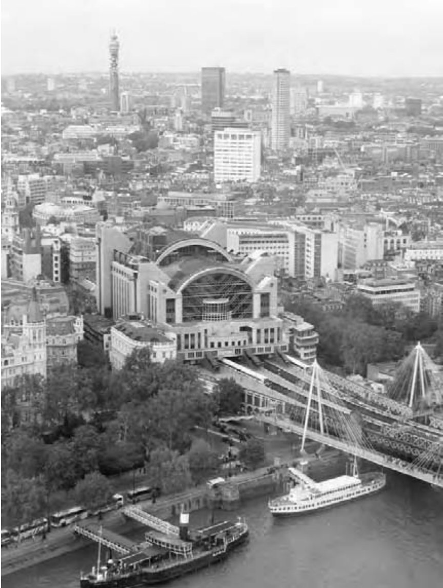
Figure 7.6 In the timekept city, according to T.S. Eliot, time ruled the way people lived; how they worked and rested and how they moved between the city and suburbs (London, UK).