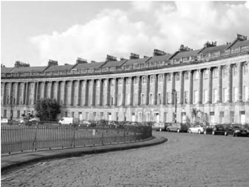
Figure 5.2 By opening the urban enclosure in the Royal Crescent, town and country were treated as equals (Bath, UK).

In a wider sense, this juxtaposition of formal and informal refers to a marriage of reason and feeling that emerged in the eighteenth century in Britain, as reflected in the work of David Hume, who criticized the unquestioned supremacy of reason and asked for the role of feeling in knowledge and action to be acknowledged. The Age of Reason had started by praising pure unaided human reason, but it developed a subtler understanding of human faculties, arguing for a balance between reason and feeling, as Kant famously tried to reconcile rationalists and empiricists in his critiques. For Hume, a major figure in the Scottish Enlightenment and