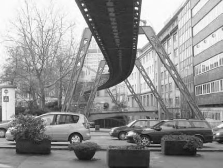
Figure 8.5 Built in 1900 and still working, Schwebebahn is a suspension railway above the river Wupper, displaying a fascination with technology taking over the city, integrating time and space through motion (Wuppertal, Germany).