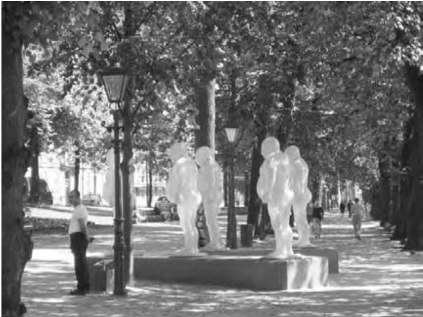
Figure 5.9 The challenge of reason by nature can be traced in the mind–body dualism and the overall negative interpretation of the body's impulses and desires (The Hague, The Netherlands).

The conflict between reason and emotion is rooted in the mind–body dualism, which we have already referred to in Chapter 2. The body was associated with nature and feeling, while the mind was representing reason and speech, which were distinctively human. The notion of rationality was overall based on seeing the disembodied mind fighting to control the body with its conscious and unconscious impulses and desires (Figure 5.9). New interpretations of the body by neuroscientists as well as psychoanalysts,