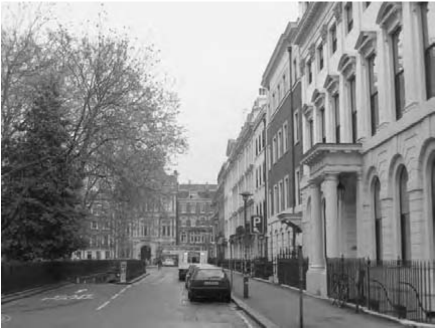
Figure 3.7 Bloomsbury Square is one of the famous squares that represent London's main contribution to urban design in the seventeenth and eighteenth centuries (London, UK).

fytter for ous than the Romain is, for their buildings wear for youse and not so profuse. 62 This meant preferring only the regularity and proportion that were implicit in the classical orders, rather than the columned orders themselves. It was a preference that became popular with developers after the 1660s, especially as Puritan Minimalism, a watered-down classicism, reduced the building costs and was more functional. 63 Financial and practical considerations of construction coincided with the ideological push for simplicity, creating an aesthetic modesty that differed substantially from the Mannerism that dominated Italy. After the Great Fire of London in 1666, the 1667 Act for the Rebuilding of the City of London formalized this approach of building simple brick buildings with neat and simple facades. Covent Garden's piazza had used giant orders of pilasters and arched portico houses, but this seemed too costly and ornamental. Bloomsbury Square and St James's Square, which were built in the 1660s, were surrounded by single-pile terraces which could be built more cheaply and quickly. This reduced the amount of investment from the landowner by spreading the costs among the lessees, also reducing the level of craftsmanship needed to construct them. These two squares set the pattern of residential London for the next two centuries (Figure 3.7). 64