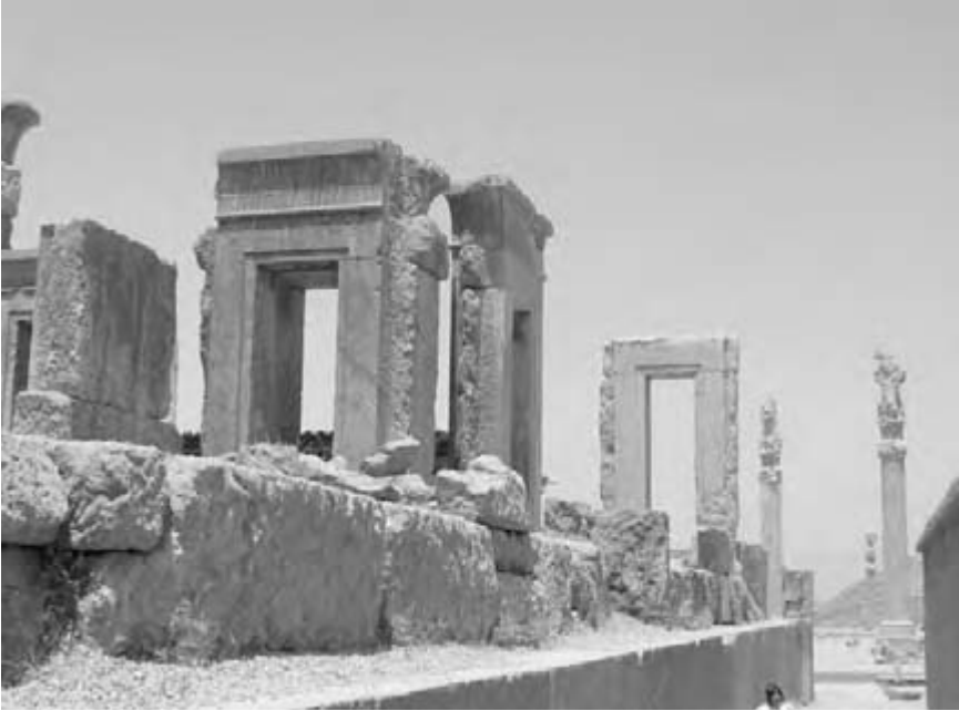
Figure 8.1 Ancient civilizations all had practical geometry, as exemplified by the need for architecture, surveying and land measurement (Persepolis, Iran).

In the sixth century BC, Thales of Miletus was the first Greek mathematician to consider ideal geometrical shapes, rather than specific material disks, squares and triangles, and to provide abstract logical proofs for geometrical problems. He is largely considered responsible for converting mathematics from an inductive to a deductive discipline. 9 Pythagoras elevated the numbers out of practical concerns and into the abstract level of philosophy. Plato stressed the interplay between mathematics and philosophy, reflected in the inscription on the gates of his Academy in Athens: ‘Let no one ignorant of geometry enter herein.’ 10 Like Pythagoras before him, Plato believed in the form and number to be at the heart of the secrets of the universe. It was Euclid, based in Alexandria, who codified the subject around 2,300 years ago, transforming it into a structure of abstract propositions and rigorous proofs supported by unchallengeable rules, definitions and axioms. 11 His book, Elements , became ‘the most influential textbook in the history of civilization’ and geometry became, and remained for millennia, the main area for rigorous mathematical pursuit. 12 Numbers and the relationships between them became spatialized and what started as measuring space turned into an abstract way of thinking about the world.