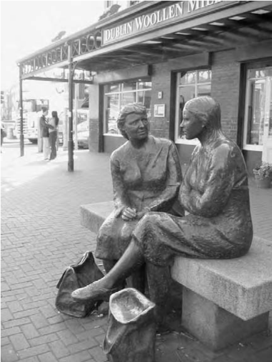
Figure 10.1 In linguistic communication, words and sentences are used to convey meaning, while non-linguistic communication uses other signs, from gestures and forms of behaviour to images and objects that we produce, display and use (Dublin, Ireland).