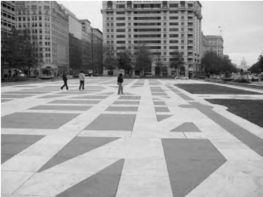
Figure 3.1 Descartes' ideal of relying on a single designer and use of mathematics was realized by L'Enfant (Washington, DC, USA).

In seeking to find and rely on a single source of authority for the design and management of cities, Descartes was not alone; it was manifest in other areas of theory and practice. Political reality of the rising absolute state coincided with the political theory of promoting a single source of authority, which was to evolve into the modern state. The humanists of