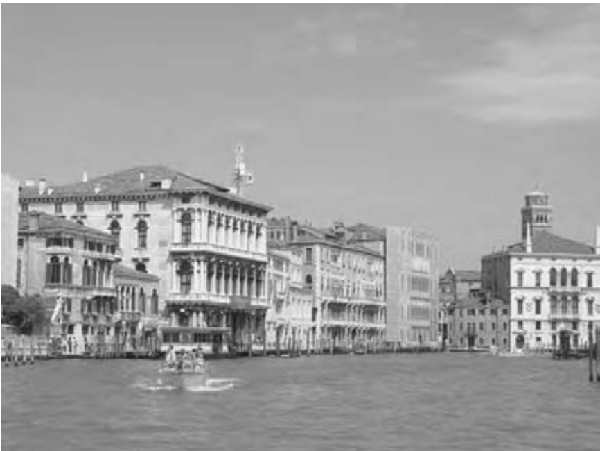
Figure 3.8 The Grand Canal was considered by a French king to be the most beautiful street in the world (Venice, Italy).

was the Seine, which was both the main route through the capital and a major showcase. In Venice, a king of France had admired the Grand Canal as the most beautiful street in the world (Figure 3.8). 70 After Venice, Paris was the first major European city to use the aesthetic possibilities of the river, which were enhanced by the improvement of the quays, development of Pont Neuf, the first uninhabited bridge, the development of Place Dauphine on Île de la Cité, and the building of grand mansions on Île Saint-Louis. 71 The most famous axis that developed to shape the city, however, was Champs Elysées, which resulted from westward expansion of the royal palace at the Louvre, beginning by the construction of the palace and the gardens of Tuileries in the sixteenth century, with its axis which ran parallel to the river. In 1667, Champs Elysées was begun by André Le Nôtre, the great landscape designer, providing dramatic views for the Tuileries palace by extending the axis of a tree-lined avenue up the hills to the Place de l'Etoile and down to the bridge at Neuilly, and beyond. 72 Later centuries witnessed new emphases on the axis: a circle of emanating eight radial streets on the top of the hill in the eighteenth century, a rond-point which was the hallmark of Baroque in France. 73 Then came the Arc de Triomphe in the middle of the circle in the nineteenth century, and extending the axis beyond the Seine to the new