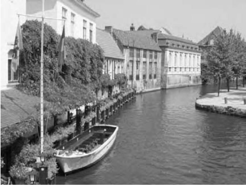
Figure 5.1 Admiration for small towns and villages and the medieval period was a characteristic of the Romantics who dominated the nineteenth century (Bruges, Belgium).

of opinion and sentiments on all subjects', freedom of taste and pursuits, and freedom of association with others. 22 Therefore, 'Over himself, over his own body and mind, the individual is sovereign.' 23 The utilitarian idea of calculating pain and pleasure to arrive at the greatest happiness of the greatest number could leave individual lives subject to the tyranny of the majority. Feelings needed to be cultivated to the same extent that reason was. The result in the private realm would lead to the stimulation of individuals' sensibilities and passions, through emphasis on poetry, art, music, nature and so on. In the public realm, the 'ordering of outward circumstances' would be far less important. 24 The eighteenth century had been convinced of its superiority over the ancient times, 'lost in admiration of what is called civilization'. 25 Rousseau's writings exploded these one-sided opinions like a bombshell, challenging 'the enervating and demoralizing effect of the trammels and hypocrisies of artificial society', and praising the 'superior worth of simplicity of life'. 26 For Mill, individual choice, through which individuals could develop according to their capacities and plans, was the only way to a happy society: 'Human nature is not a machine to be built after a model, and set to do exactly the work prescribed for it, but