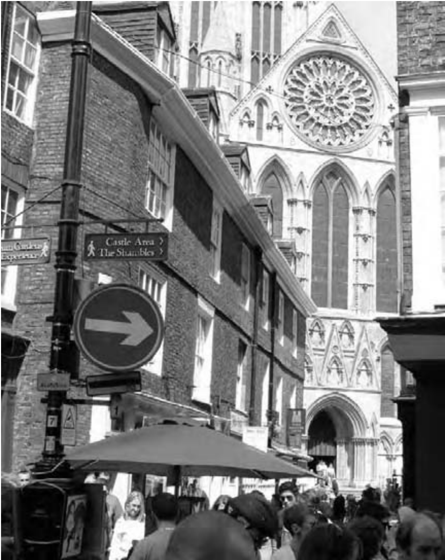
Figure 2.5 St Augustine's City of God could not be built in this world, so it had to mingle with the earthly city (York, UK).

the body. Following the soul would lead to salvation, while following the body could only end up in loss.