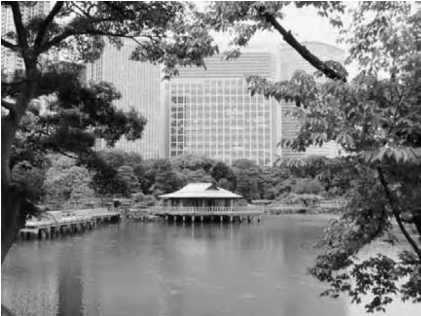
Figure 7.3 Two interpretations may exist side by side. Natural cycles have historically generated a cyclical sense of time, whereas the chains of cause and effect have created a linear notion of time in the modern life (Tokyo, Japan).

Whereas in the cyclical notion of time, rituals and festivals are associated with the natural cycles, the linear time traces a cause and effect process (Figure 7.3). Inherent in the notion of causality, of causes and consequences, is a linear notion of time. As the proverb has it, one thing leads to another, which is an indication of a sequence of related events,