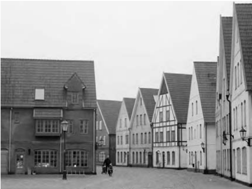
Figure 5.6 Escape into the past has created a brand new medieval village, popular with the market but not so with the architects (Lund, Sweden).

Part of the nostalgic romanticization of the countryside is a desire to escape from the city, from the space that we inhabit but are not content with. This has taken people out of the towns into the countryside, small villages and, if not possible, to suburbs. Another part of this romanticization is to escape from the present, to imagine a past that was somehow better than now (Figure 5.6). This in the nineteenth century was