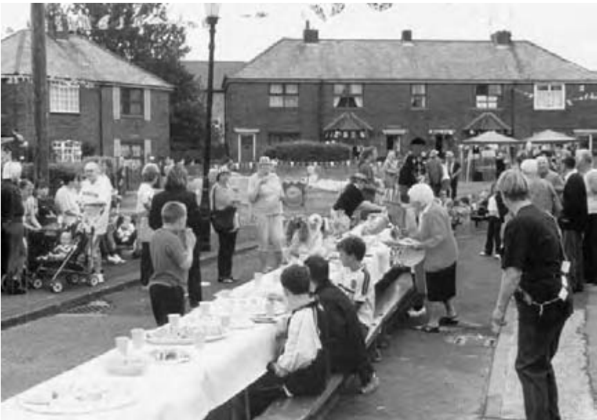
Figure 6.5 People are embedded in particular sets of social and spatial relationships, and any change needs to involve them, rather than being imposed on them (Newcastle, UK).

There are at least at two levels that we can see attention to place-making: local and regional. At the local neighbourhood level, place is a clearly demarcated framework for outside intervention. At this level, the approach of targeting resources would focus on areas of industrial decline