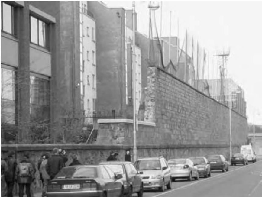
Figure 8.6 A high wall protects a gentrified area from the adjacent poor neighbourhoods, which is hated by those left on the outside (Dublin, Ireland).

With the rise of the modern city, new forms of segmentation have emerged: rich and poor live apart in their segregated neighbourhoods, even to the extreme level that some have gated and walled themselves apart from the rest (Figure 8.6). City centres and suburban peripheries are