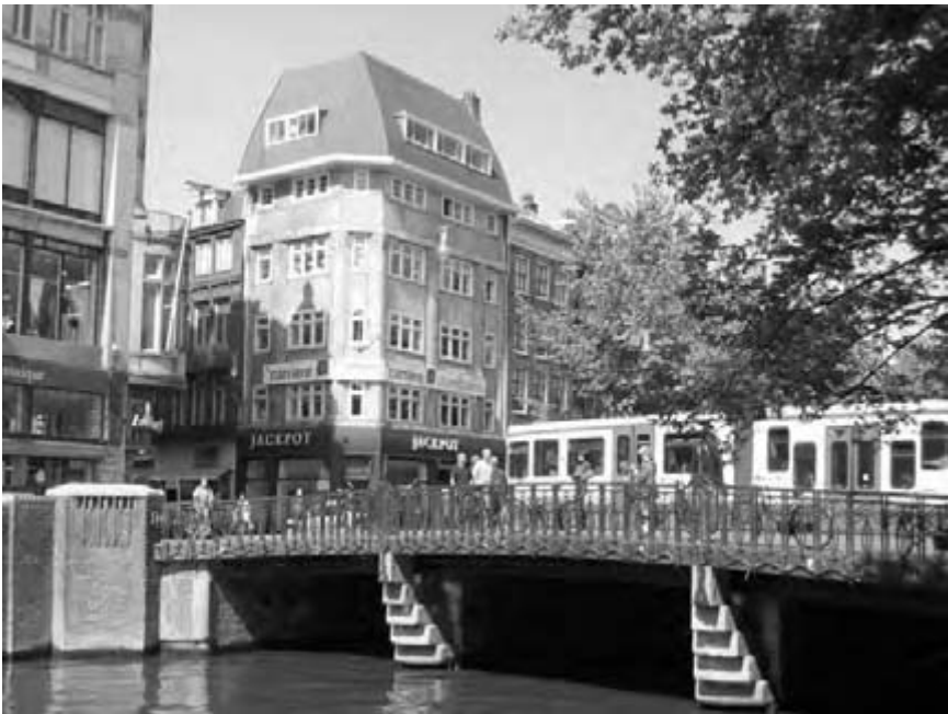
Figure 3.3 A network of canals has shaped the city, a regular geometry as the backbone of the urban infrastructure (Amsterdam, The Netherlands).

The Renaissance established a new principle that had not existed in the medieval period: creating spatial coherence for a public space by coordinating the buildings around it in some harmony. Before, arcades in