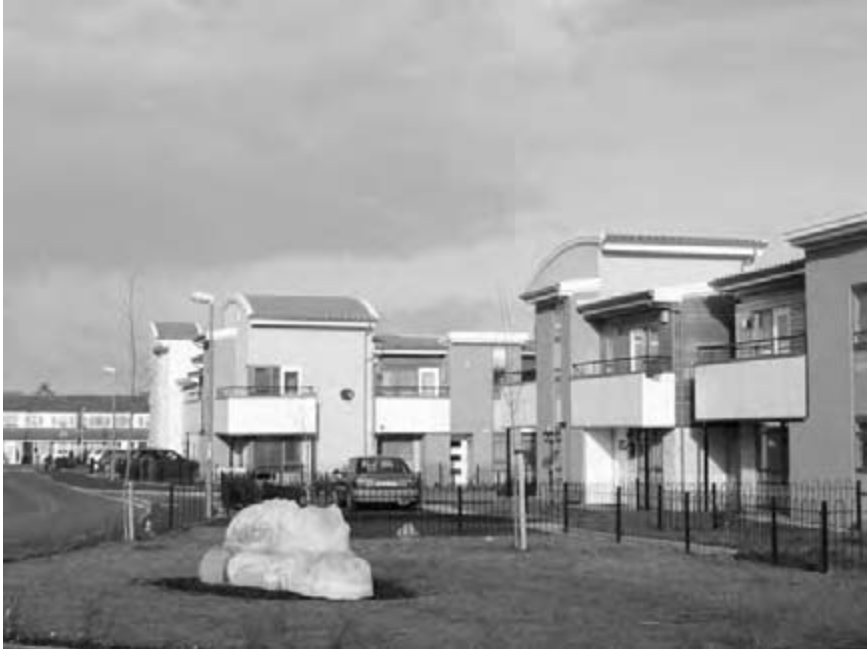
Figure 10.6 The same objects and places can have different meanings; in a peripheral neighbourhood, these new buildings were identified by the authorities as innovative, but described by a resident as 'a designer's dream and a resident's nightmare' (Birmingham, UK).

aesthetic enjoyment. 46 The statue of a god or a king at the time that it was set up had a relatively clear meaning; often to generate awe, respect and obedience in the subjects. But long after the time of its erection, the statue may turn into an object of curiosity, an aesthetic experience or a glimpse into an obscure past. At the time, it was a public symbol which transmitted to the rest of society the wishes and intentions of those who set it up. It gave out a set of signs that most could read, reflecting the political and economic reality of the time, as well as symbolic sensibilities and social institutions. Now, it can only generate a guess, as it is the case with the buried objects archaeologists discover from previous civilizations. The lines of communication have been disrupted, as the multidimensional links that full involvement with a society provides are not in place. The lines of communication are at best ambiguous, and at times limited to an aesthetic impression.