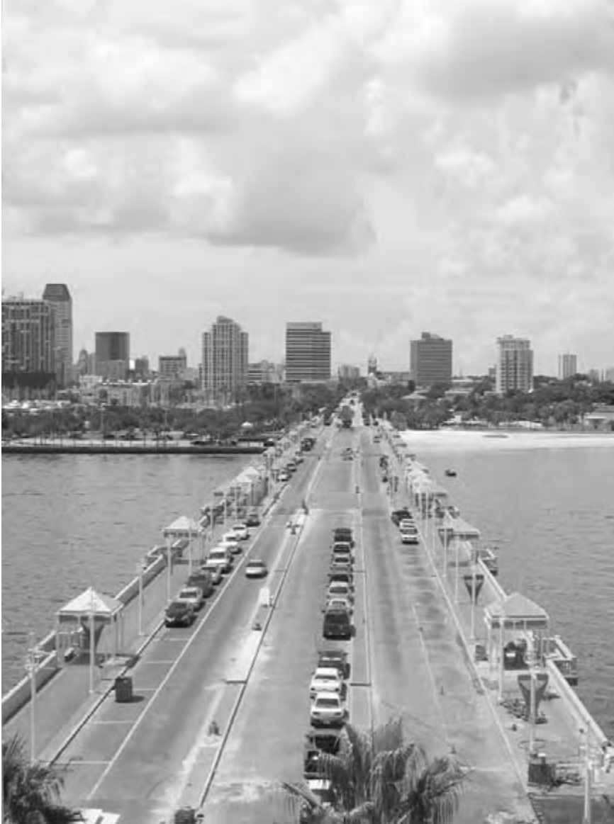
Figure 11.1 The division of labour in urban space has created functional and social distinctions between centres and peripheries, different neighbourhoods, and different land uses (St Petersburg, Florida, USA).