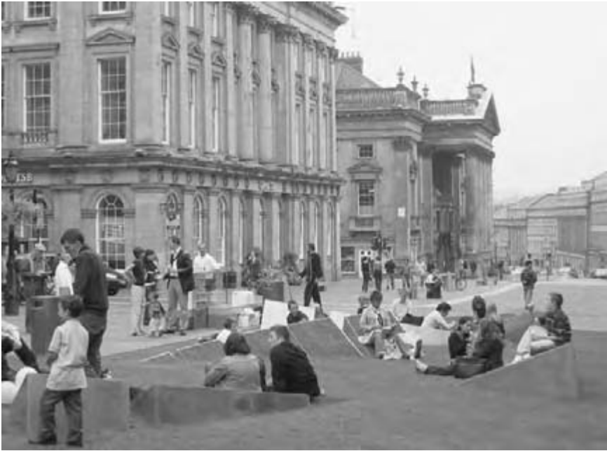
Figure 8.7 Place can be as porous and flexible as space. A temporary park in the middle of the city can become a place for a short period of time (Newcastle, UK).

between rationalism and Romanticism; the distinction that we see between the Enlightenment thinkers, such as Hume and Smith, and their critics, such as Ferguson. The forces of modernism and capitalism that were unleashed in the eighteenth century are still expanding, and dealing with them is apparently a task of managing and regulating these forces rather than removing them. It is a tension between exchange value and use value, between view from outside and inside, between calculation and attachment. In a sense, both of these sides are necessary parts of our everyday life, and are continuously used by most people. While I have use value, a view from inside and emotional attachment to my place, I will look from outside at other people's places, which could be even be cold and detached. View from outside cannot be banned; it can only be invited to be sympathetic and understanding, or harnessed and systematized to be functional and useful. Similarly, view from inside cannot be banned; it needs to be put in touch with other such views to enable intersubjective communication and coexistence.