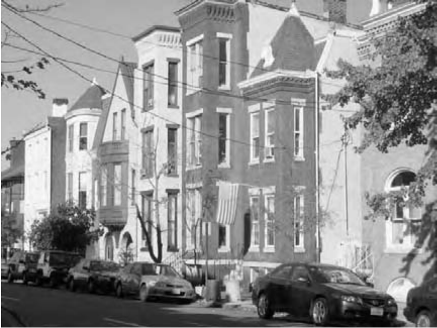
Figure 11.5 A living city cannot reach a final stage beyond which nothing changes, as exemplified by the changes introduced to any historic area, even those built during the Age of Reason (Alexandria, Virginia, USA).

harmony. However, the ambitions of taking everything into account in making the necessary connections have proved stifling, as the complexity of urban life makes it difficult and undesirable to have everything under full control. As this control tends to be exerted by some over the others, rather than being generated through collective participation and agreement, and the aesthetic harmony may appear to reflect this, pressure for connectedness may lead to resistance and doubt. Critiques of comprehensive planning and calculative reason are different forms of reaction against the imposition of a particular instrumental reasoning onto society, especially when there is a gap between account and action. The application of reason in city design and development involves a process of segmentation and connection, analysis and synthesis, in which space is divided into parcels and units, allocated functions and monetary value, and reconstituted as blocks of social life. However, without involving those who are affected or addressing the environment in which they take place, the reconstitutions that are produced by the market or by the state planning are not the only possible accounts, nor the best courses of action.