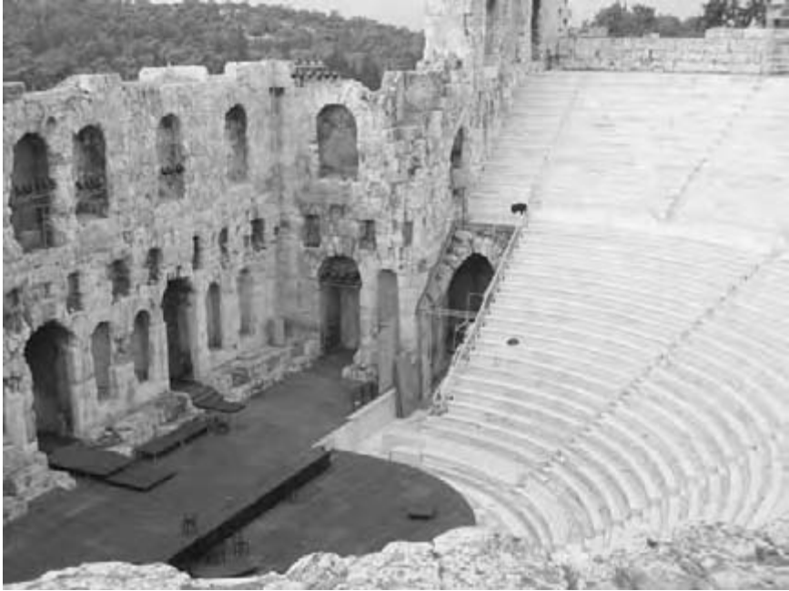
Figure 10.2 Providing convincing accounts for our beliefs and actions is always a narrative, told from one perspective, and delivered in different forms: from interpersonal communication to public displays and performances (Athens, Greece).

one simple exchange, but an ongoing conversation, which can only be successful if a critical question and answer conversation is possible. As Mill had insisted, human wisdom could only result from the ‘steady habit of correcting and completing his own opinion by collating it with those of others’. 17 This required an environment in which freedom of expression was guaranteed, as well as appreciating that the truth may have many sides: ‘the only way in which a human being can make some approach to knowing the whole of a subject is by hearing what can be said about it by persons of every variety of opinion, and studying all modes in which it can be looked at by every character of mind’. 18 Nietzsche says almost the same, but in his own words. He warns us that any rational analysis is an interpretation from a viewpoint, but to counter the effects of entrapment in a single perspective, Nietzsche suggests we ‘employ a variety of perspectives and effective interpretations in the service of knowledge’. 19 As he puts it, ‘the more affects we allow to speak about one thing, the more eyes, different eyes, we can use to observe one thing, the more complete will our “concept” of this thing, our “objectivity”, be’. 20