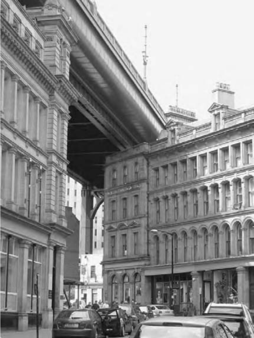
Figure 4.6 The logic and aesthetics of technology are employed to reshape the city (Newcastle, UK).