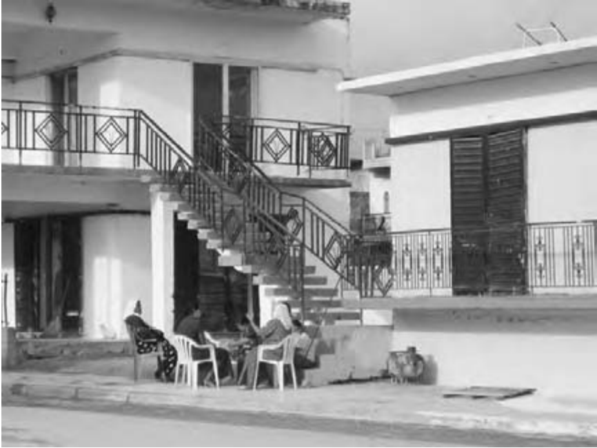
Figure 6.7 The concentration of vulnerable populations leads to a cluster of social problems; in this case putting pressure on gypsies' use of public space by other residents in a suburban neighbourhood (Athens, Greece).

organizations associated with particular areas? Research evidence suggests a forum is useful to negotiate different and competing needs, but that also it can turn into a bureaucratic and undemocratic exercise. Or do we need to reorganize the existing services on a spatial basis and encourage them to network and collaborate? Experience in Denmark and the UK suggests moving away from local arrangements such as area committees, what some Danish politicians called 'little kingdoms'.