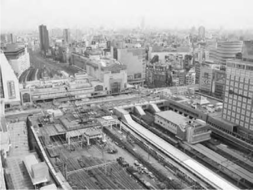
Figure 7.4 The experience of time is relative to the observer, not only at the speed of light, as Einstein had shown, but also in everyday experiences such as being static or mobile, near or far, etc. (Shinjuku train station, Tokyo, Japan).

of time. In a sense, the new scientific interpretations of time get close to the idealist interpretations such as Kant's. He saw time as a subjective condition: 'Time is not something objective. It is neither substance nor accident nor relation, but a subjective condition, necessary owing to the nature of the human mind.' 68