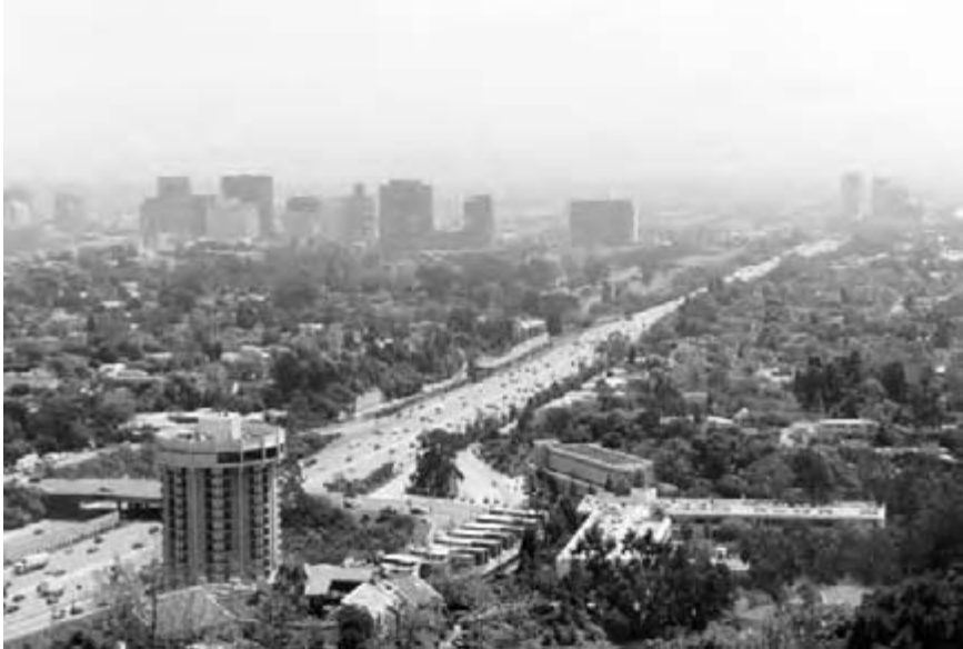
Figure 4.5 Transport and communication technologies have enabled the cities to grow and scatter in all directions (Los Angeles, USA).

1970s and the process of deindustrialization, central cities declined further, while jobs, shops and recreation followed housing to the suburbs. Whereas suburban shopping malls, business parks and housing subdivisions grew, the central city's buildings and infrastructure declined, becoming places of poverty and disadvantage. Although downtown has remained a centre of considerable economic and political power, 49 historical connections between the city and periphery have weakened. There has been a flow of immigrants and a return of the middle class to the city, but not yet in a large enough scale to revive its tax base and change the degree of its decline.