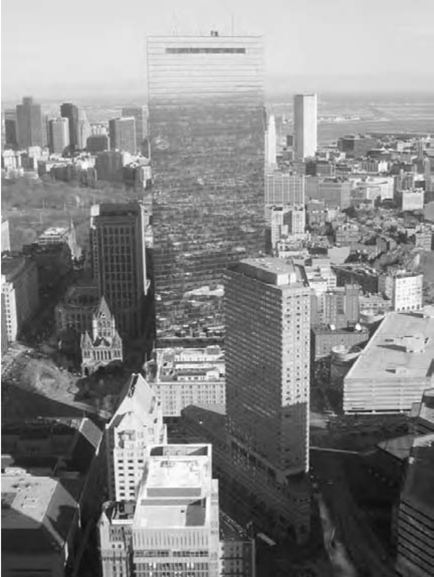
Figure 9.5 According to the urban land theory, competition for the most accessible and desirable locations shapes the urban landscape (Boston, USA).