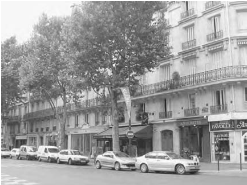
Figure 11.2 Boulevards were manifestations of connected thought and action performed by a powerful segment of the society (Paris, France).

The examples of this ambiguity are plentiful in the history of city building. The redevelopment of Paris in the nineteenth century by Eugene Haussmann is one example. It shows a great deal of coordination on the part of the authorities, but not collaboration with the populations it affected. The Parisian boulevards were manifestations of connected thought and action performed by a powerful segment of the society (Figure 11.2). They were examples of connection in thought and action, but forced onto the slum dwellers and revolutionaries who were thrown out of their homes to pave the way for the wide boulevards. Many other urban renewal examples from the second half of the twentieth century show the same gap: while it appears rational to one group who gain from the process, it is beyond comprehension for others who lose out. A network of connections has been made, but primarily in the interests of one section at the expense of another section of society. While connections have been strong and voluntary for the former, they have been forced and weak for the latter. Asymmetrical connections characterized this type of city development. Would this be as rational as examples in which the connections