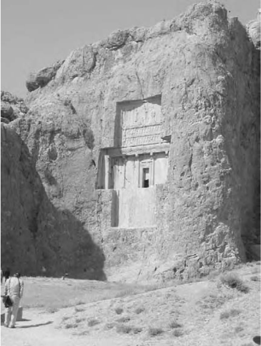
Figure 10.3 Fixing and transmitting meaning through time was made possible through writing (Naghsh Rostam, Iran).