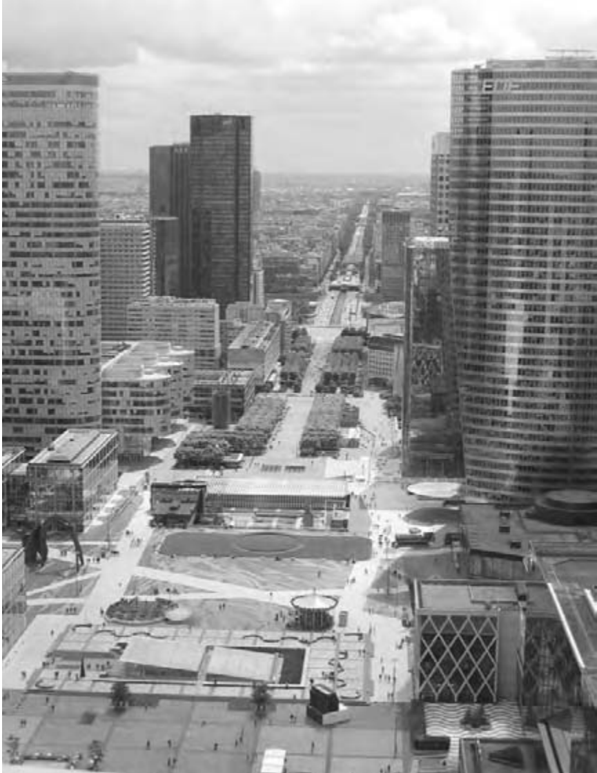
Figure 3.9 Champs Élysées exemplifies how a major axis can form the backbone of urban space (Paris, France).

The creation of this avenue gave Paris an axis and a sense of direction, which were among the notable features of Baroque architecture. It was similar to the opening of vistas for smaller palaces in the countryside,