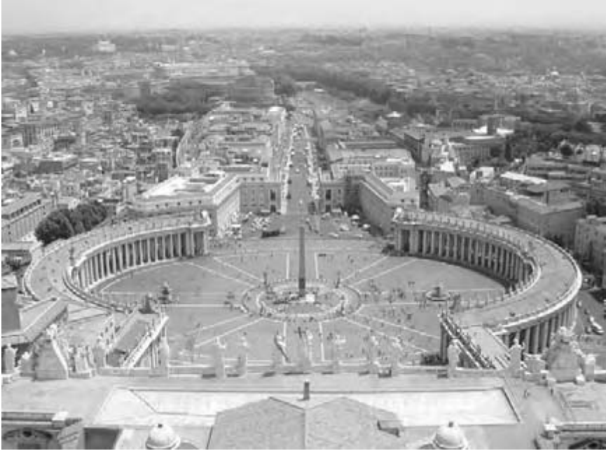
Figure 3.2 An obelisk in front of St Peter's provided a single centre on which vistas converged (Rome, Italy).

In turn, the calm harmony of Renaissance urbanism gave way to Baroque's sense of direction. The Renaissance space is a ' limited space at rest ', while the Baroque space is intended to create an ' illusion of infinite space ', relying on open vistas and grand scales that reflected the power of absolute rulers. 38 In the seventeenth century, when Descartes was developing his philosophy, Baroque was the style of the day, which was adopted to form the French classical architecture of the time. Baroque coincided with counter-reformation in Roman Catholic countries; it was characterized by its rich decoration, optical illusions, curved facades, oval plans, coherence of parts, movement in space and, in a return to Gothic, emphasis on emotion. 39 The seventeenth century was a period of transition in France from a Renaissance state into absolute monarchy, where the Bourbon kings ruled the country with a small bureaucratic elite and a loyal army. 40 The court was engaged in a top-down process of centralization, to subordinate the aristocracy, provincial governors and local institutions; certain groups anxious for tax reform encouraged this intervention, 41 while the king had to purchase the cooperation of the elite, 42 and seek legitimacy through establishing patron-client relations with the urban society. 43 Descartes also lived for 20 years in isolation in Holland to concentrate on