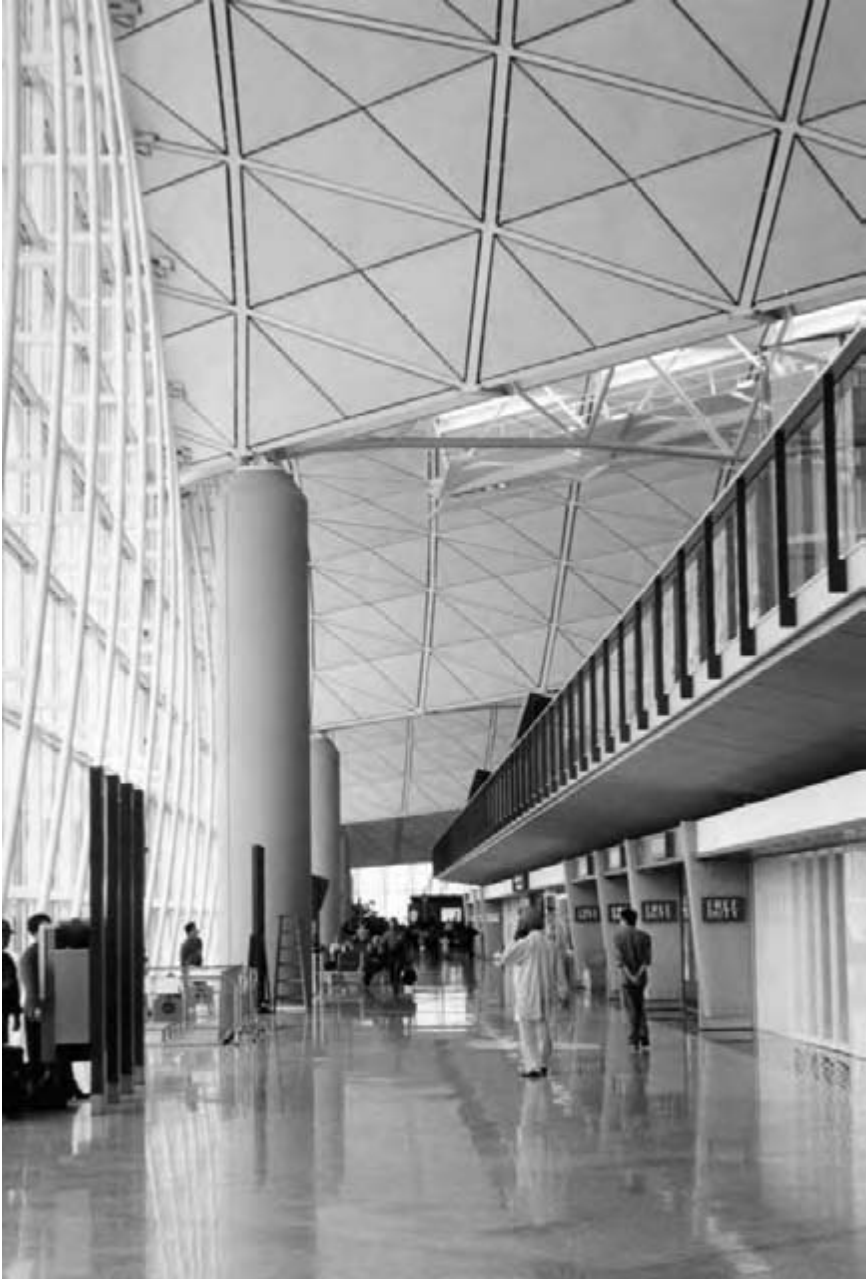
Figure 7.7 Ever faster technologies of transport, information and communication have led to the age of speed (Hong Kong airport, China).