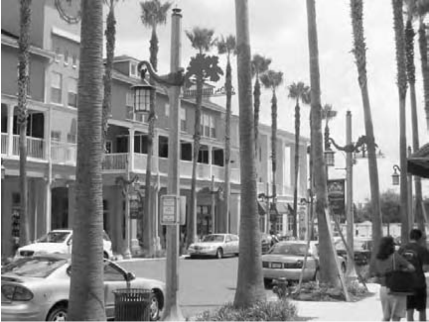
Figure 9.3 Urban development projects are based on a system of value; only some claim to make their values explicit (Celebration, Florida, USA).

maximize utility in the city. Designers may aim at balancing functionality and aesthetic appeal. Private investors may aim at maximizing returns on their investment. Each group appears to follow different aims, with potentially different intentions and values. While citizens' well-being may drive some actions, monetary gains drive others. Some focus on providing basic public services, others search for maximizing the possibility of choice. Some see citizens as a homogeneous group with similar interests and needs, while others see nuances and differences. Some work on the basis of egalitarian principles, others aim at generating luxury and secure places for those who can pay the highest. These assumptions generate different types of city; and as the city grows over time, it becomes a mosaic of fragmented places, reflecting different intentions and values. 46