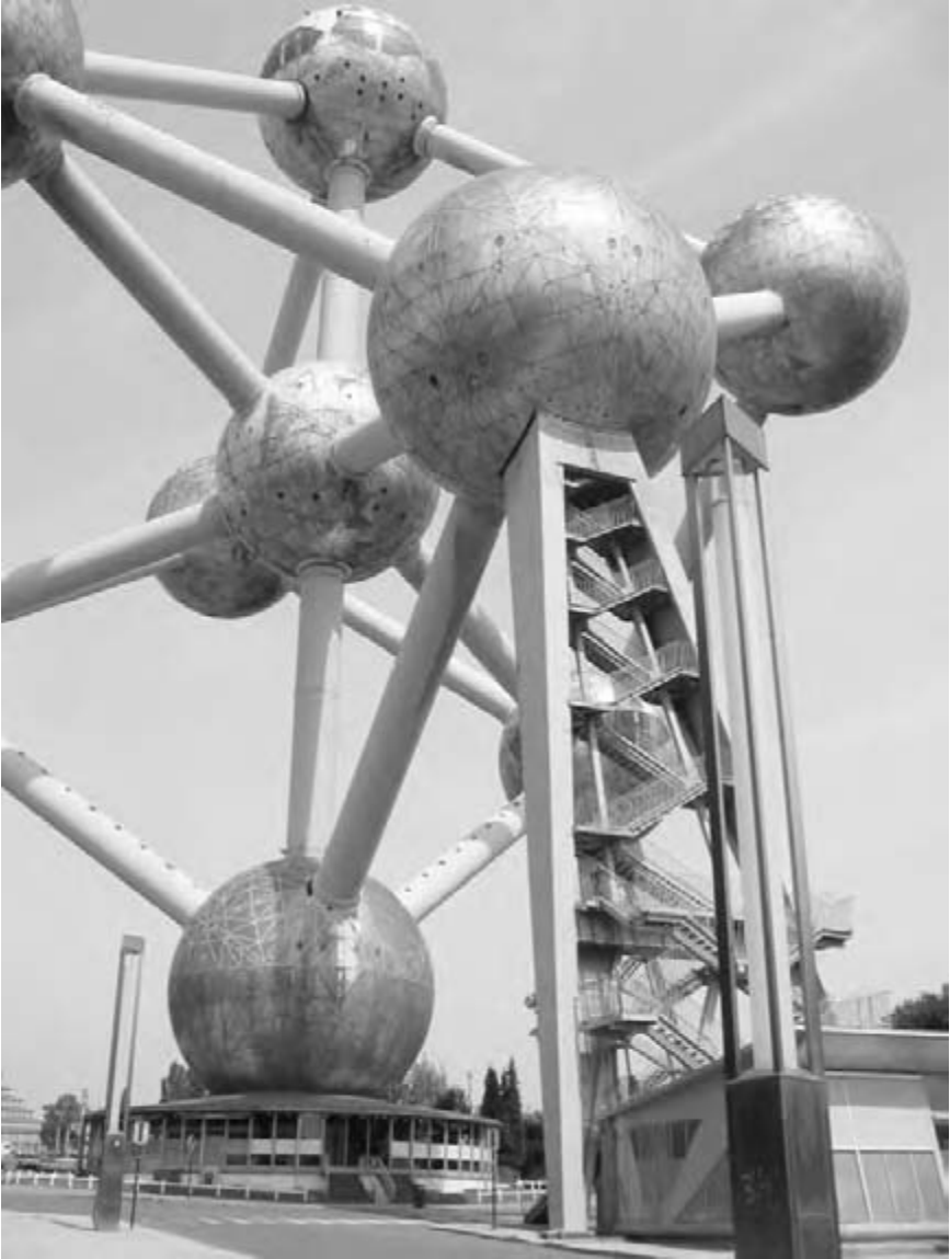
Figure 9.1 An analytical approach to the world has segmented it into its constituent parts (Brussels, Belgium).