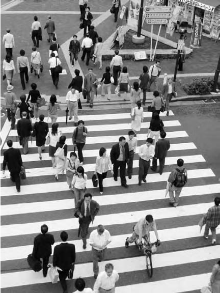
Figure 11.3 The presence of millions of intelligent and sensual actors, and the complexity with which they make their decisions, makes it impossible, and undesirable, to plan for all eventualities and to cover all transactions and communications (Tokyo, Japan).