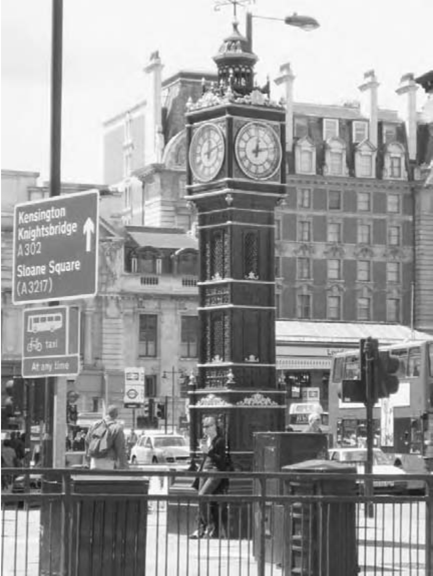
Figure 7.5 The experience of time is relative to the present, hence the notion of flow of time in a direction from the past to the future (London, UK).