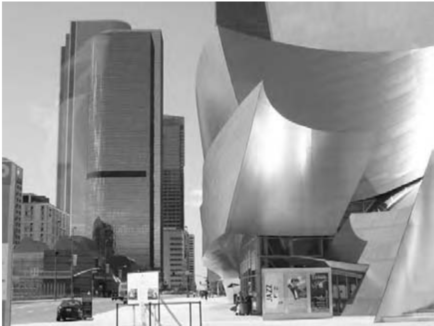
Figure 4.1 The ability to build drives the agenda of urban design and development, pressing to be the most important consideration in the shape of the city (Los Angeles, USA).

The logic of technology is one of the key manifestations of productive reason, which lies at the heart of city building. Technology has been defined as ‘the use of scientific knowledge to specific ways of doing things in a reproducible manner’. 10 The characteristics of buildings, roads, open spaces and other urban elements reflect at once the social circumstances as well as technological abilities of its inhabitants. Technological change is caused by, and leads to new, social conditions. Technological innovation is famously a result of necessity, and once developed it helps create new circumstances and possibilities for change. No other period in human history has seen more dramatic technological changes than the past two centuries, resulting in urban forms that seem to have had no precedent, although their roots may be traced in the past. Vast cities that have spread horizontally and vertically have been made possible by technological developments that have brought about wealth as well as misery, and a higher quality of living as well as congestion and environmental degradation.