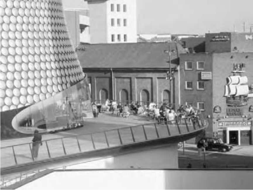
Figure 6.8 Postmodern designs challenged the modernist aesthetic consensus and promoted eclectic tastes and playful appearances (Birmingham, UK).

individual liberty and social cohesion. As globalization enables a faster and freer movement of ideas and practices across the globe, local distinctions are under pressure. As it mobilizes people and makes it possible for large numbers to move from one city to another, one country to another, it generates increased levels of diversity in cities around the world. The question that emerges, then, is: what could design for a multicultural city be like?