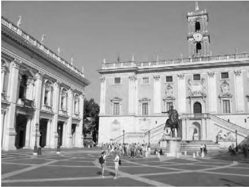
Figure 3.5 In Campidoglio, Michelangelo introduced a monumental use of sculpture in public spaces, changing the morphology of urban squares through central planning (Rome, Italy).

practices. The sixteenth century is the time when artists and architects in Britain, France, the Netherlands, Spain and Germany turned their back on their Gothic past and embraced Italian Renaissance styles. In designing Renaissance cities, such as Vitry-le-François in mid-sixteenth-century France, the relationship between the square and the streets changed. In medieval squares, streets entered the space at its corners, leaving the centre free for commercial or other activities. But the streets now entered the square at the middle of its sides, which accommodated traffic and put a visual emphasis on the central point, where a statue or monument could be placed. 50 The design of the square thus was changing according to the principle of central composition, whereby the entire composition revolved around a central point, which now often marked the glory of the absolute rulers. At the scale of the city, the square was now beginning to play the role of a central node, connecting a set of geometrically regular streets into a network of transportation and communication. This was part of seeing the entire town as a single composition, rather than a collection of separate parts. Nevertheless, this approach was still only possible in new small towns; large cities such as Paris could only see isolated developments on