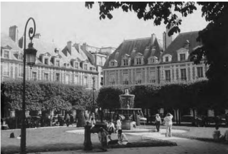
Figure 3.6 Place des Vosges (originally Place Royale) was completed in 1612 and is considered the prototype of residential squares in Europe (Paris, France).

Place des Vosges is considered to be the prototype of residential squares in Europe (Figure 3.6). On a site near the city walls and the Bastille, it had gone through several phases of development and decline, before it was planned to become a factory. However, the king decided that a square should be built there; first the three sides of the square were built in front of the factory and, after the closure of the factory, the fourth side was also built on its site. It was completed in 1612 and was named Place Royale. Rather than fronting houses onto the busy and crowded streets, which was a feature of medieval towns, this was a space that excluded and discouraged traffic, creating an enclosed and exclusive residential environment. To emphasize the unity of composition, the 38 houses that surrounded the square were ordered to have uniform facades: a row of dormer windows in