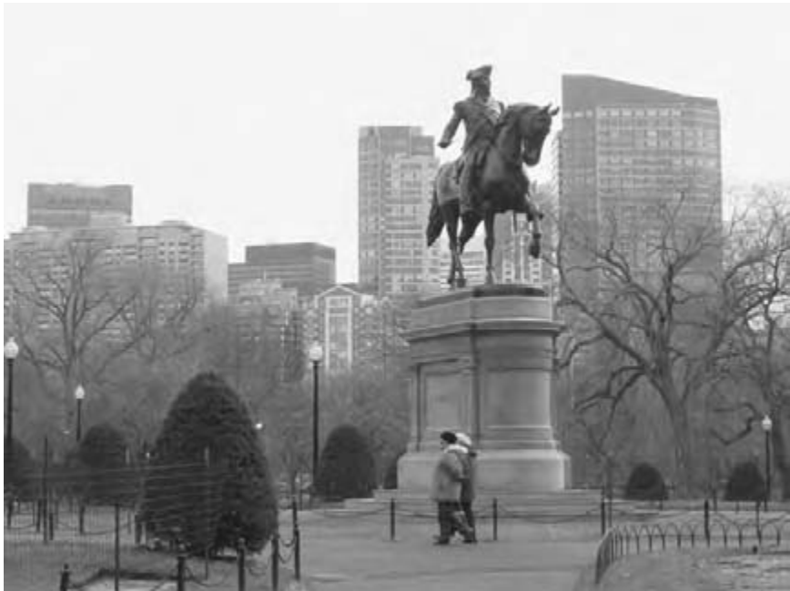
Figure 4.7 Production of space lies at the core of the way a society is developed, testifying to its different priorities through the ages (Boston, USA).

The production of the city takes on a complex meaning, as it involves different agencies undertaking a variety of tasks. It involves a complicated set of factors, which can be grouped into the agents of production, the skills and ideas they employ, the tools and resources they deploy, and the context in which production takes place. 60 Each of these areas of